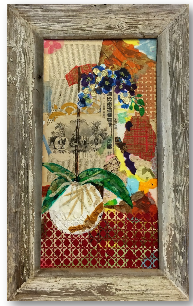
Oriental Orchid (Orchid #1) Mixed Media 30"x16"