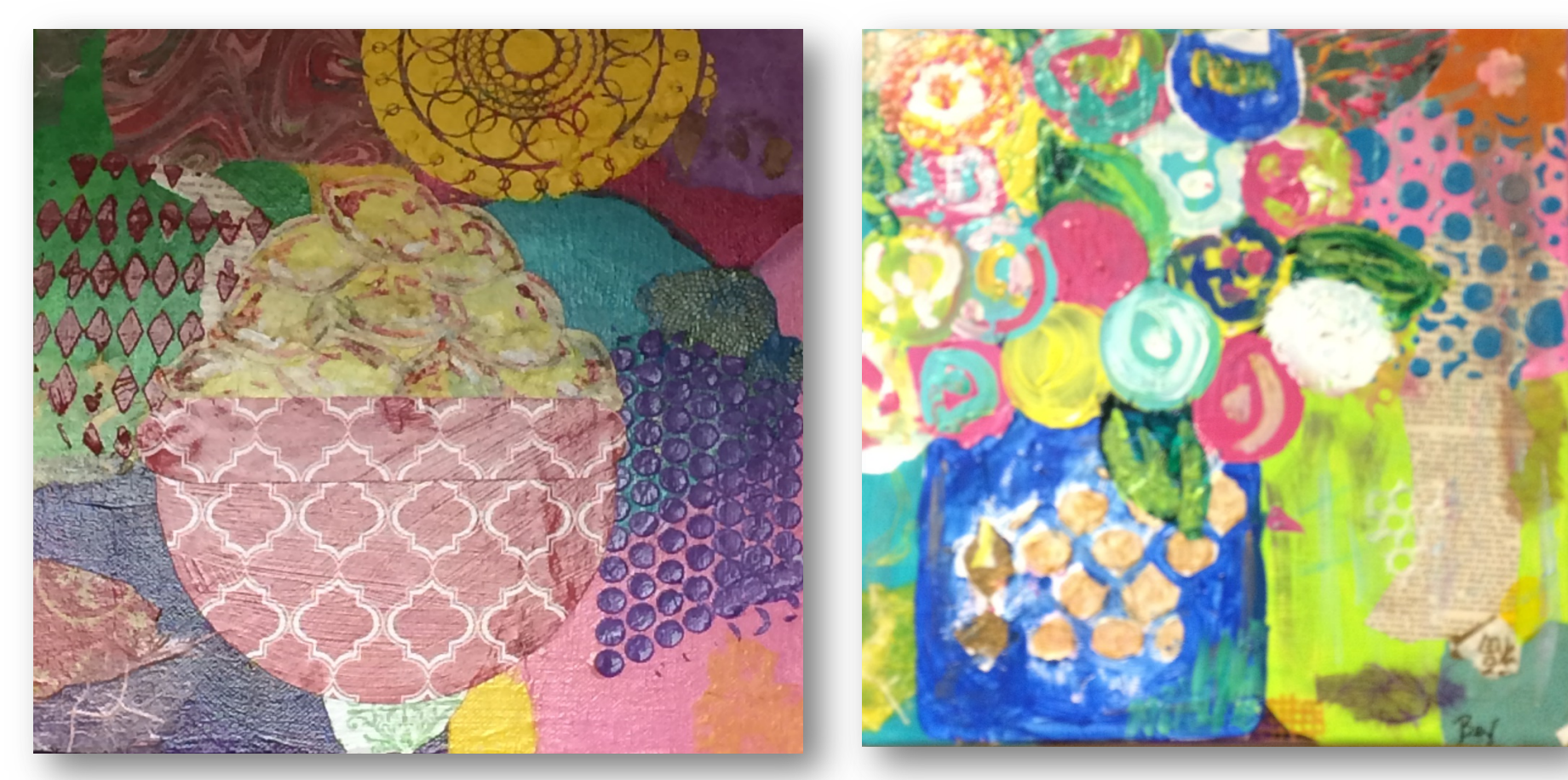
"Make Mine Lemons" Mixed Media 12"x12"

"Don't Mind Me Mr. Lee" Mixed Media 12"x12"